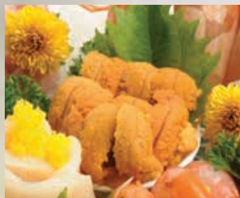
うに刺身 UNI 35G 38