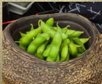
枝豆 $4.8 EDAMAME