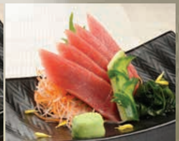
本鮪赤身刺身 MAGURO 5PCS 26