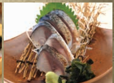
メ鯖刺身 SHIME SABA 5PCS 9.8