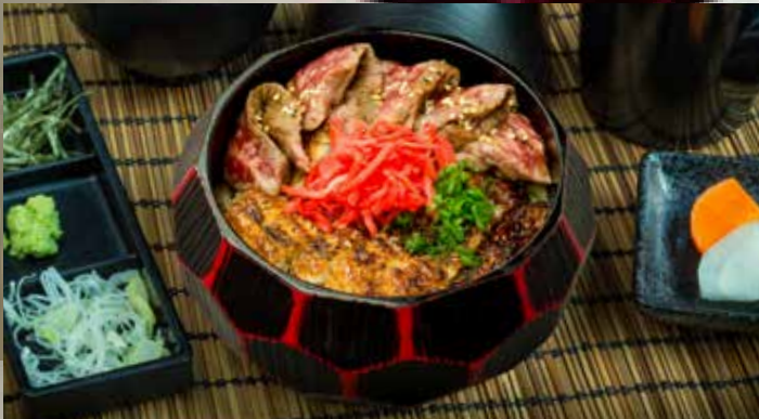
鰻和牛ひつまぶし UNAGI WAGYU HITSUMABUSHI $46.8