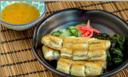
鰻白焼き みそ掛け $12.8 UNAGI WITH MISO SAUCE