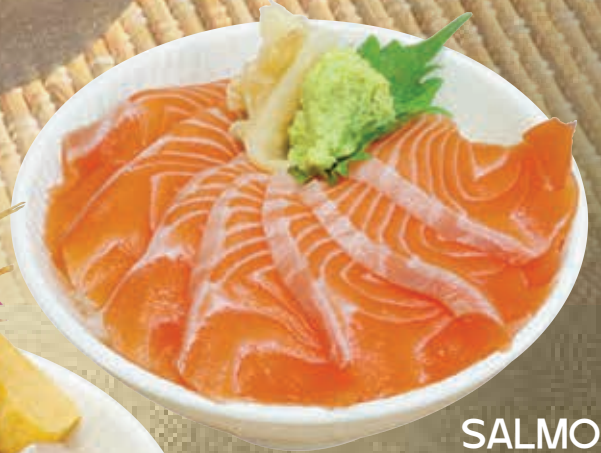
SALMON DON SET 18.8