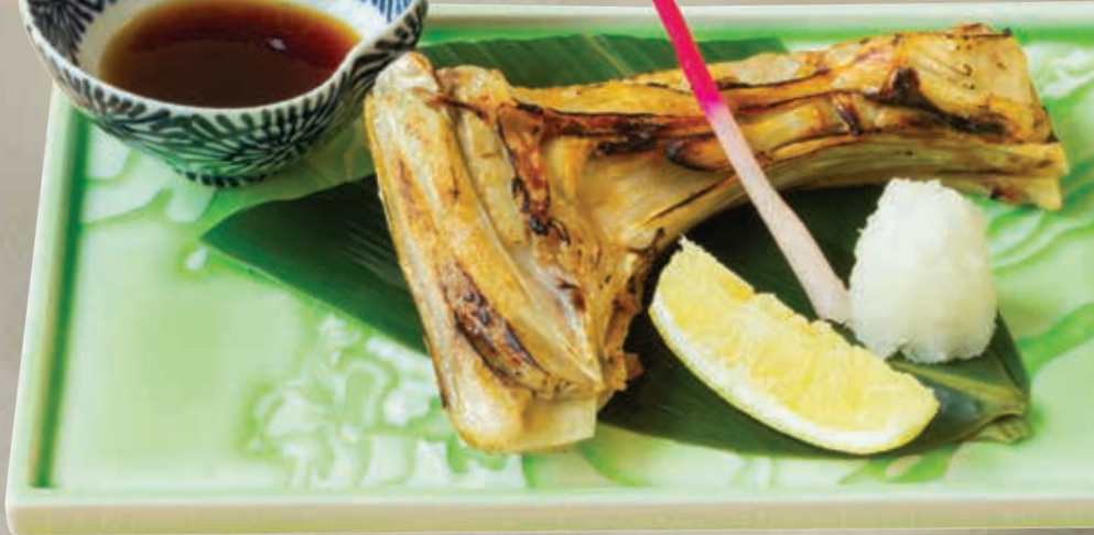
マグロカマ焼き $22.8 MAGURO KAMA