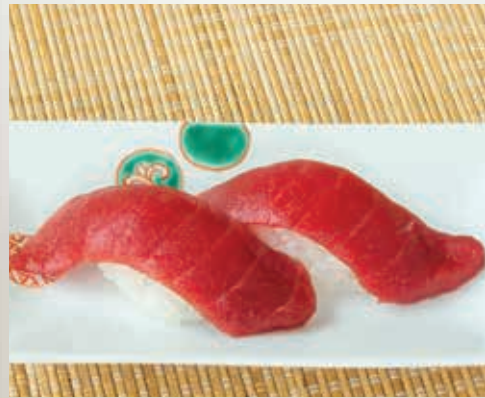
赤身 MAGURO SUSHI