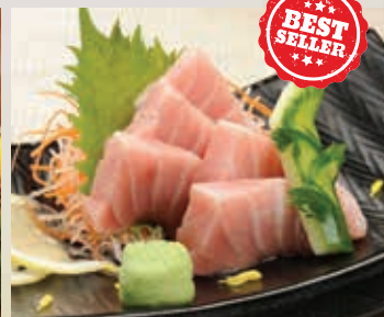
本鮪大トロ刺身 OTORO 5PCS 38