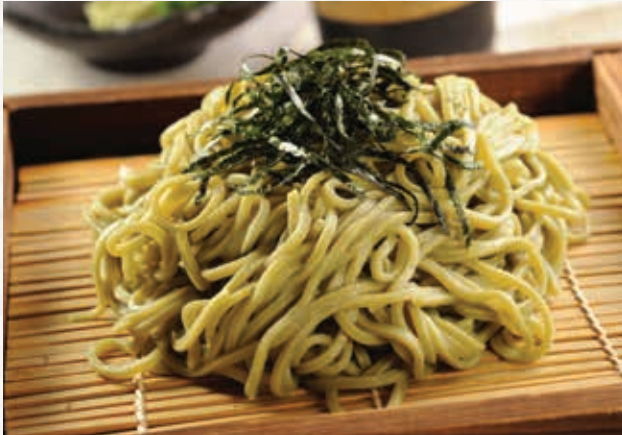
そば (冷・温) SOBA (COLD/HOT) 12.8