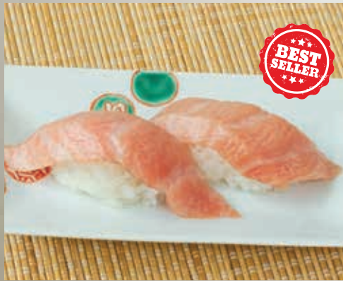
大トロ OTORO SUSHI