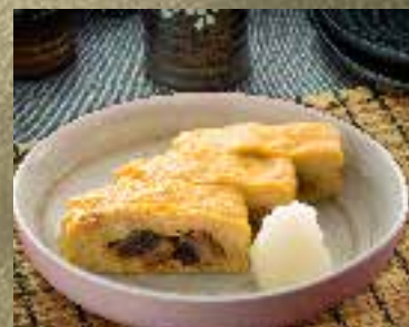
うまき $12.8 UMAKI