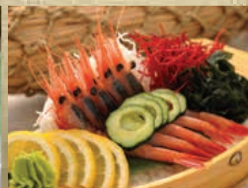
赤海老刺身 AKA EBI 5PCS 9.8