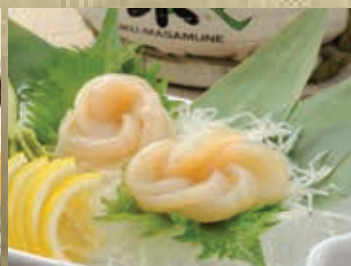
ホタテ刺身 HOTATE 5PCS 12.8