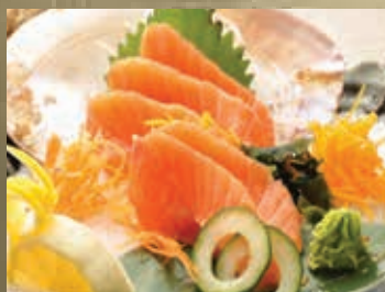
サーモン刺身 SALMON 5PCS 12.8 サーモンベリー刺身 SALMON BELLY 5PCS 17.8