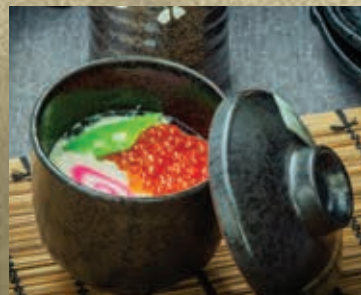
いくら茶碗蒸し $5.8 IKURA CHAWAN MUSHI