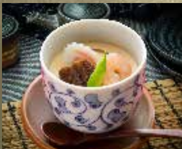
鰻茶碗蒸し $4.8 CHAWAN MUSHI