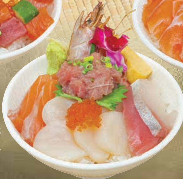
HOTATE KAISEN DON SET 24.8