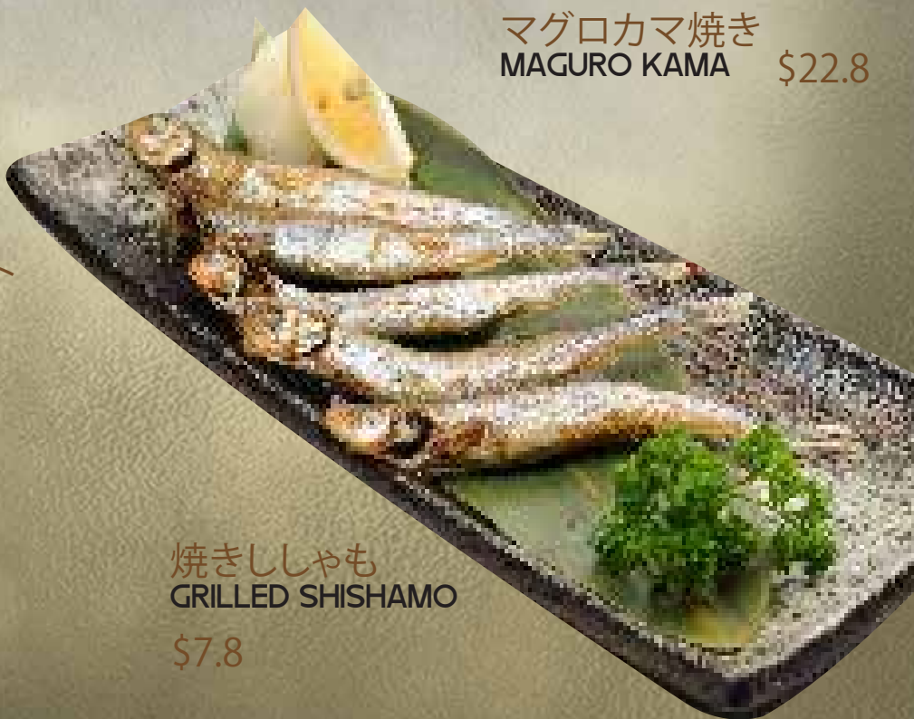
焼きししゃも $7.8 GRILLED SHISHAMO