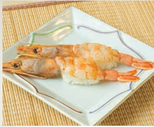
赤海老 AKA EBI SUSHI