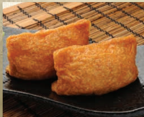
いなり INARI SUSHI