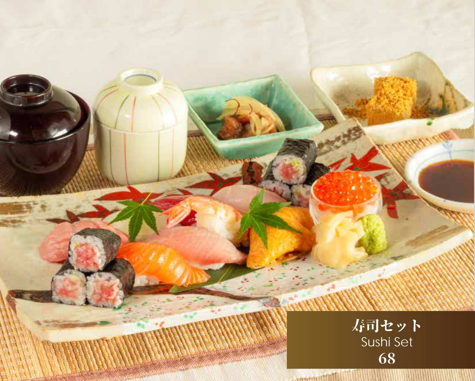
寿司セット Sushi Set 68