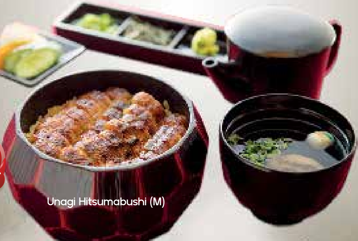
Unagi Hitsumabushi (M)