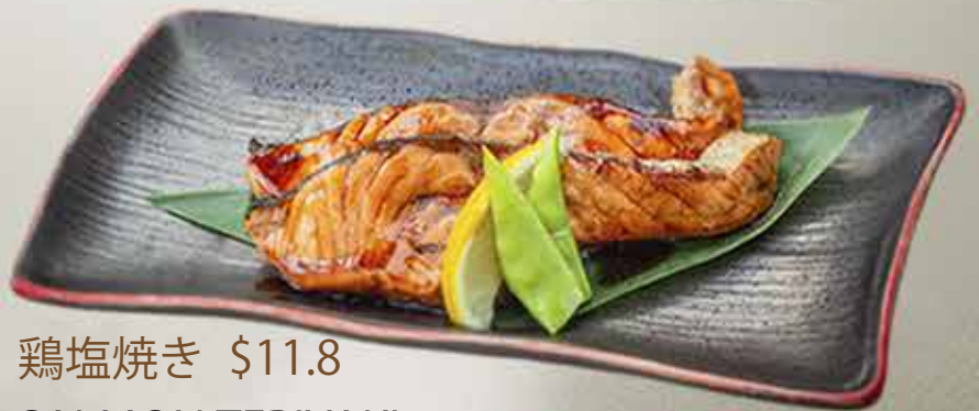
鶏塩焼き $11.8 SALMON TERIYAKI