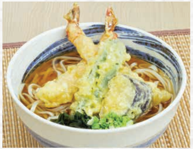
天ぷらうどん/そば TEMPURA UDON / SOBA 16.8