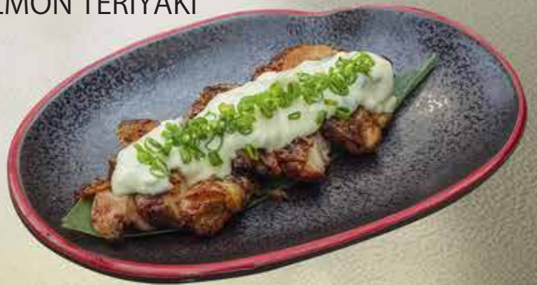
炭焼きチキン南蛮 $11.8 GRILLED CHICKEN TARTAR