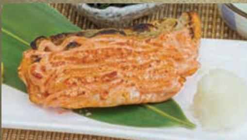
銀ダラ明太子セット $23.3 GINDARA MENTAIKO