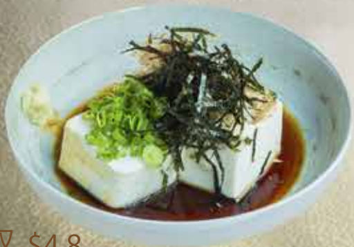
冷奴 $4.8 COLD TOFU