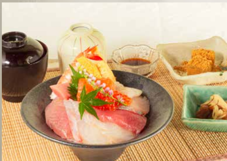
海鮮丼 Kaisendon 48