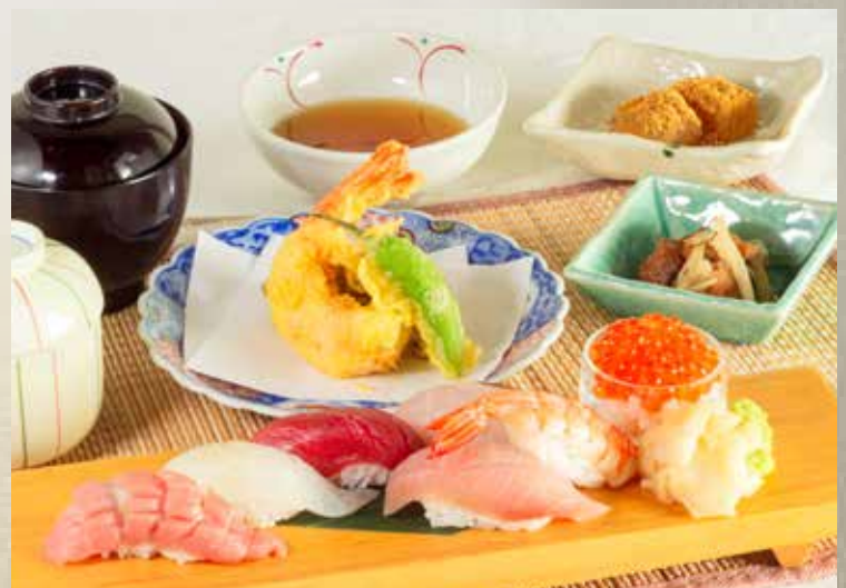
寿司天ぷらセット Sushi tempura set 58