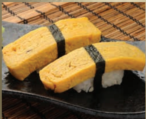
玉子 TAMAGO SUSHI