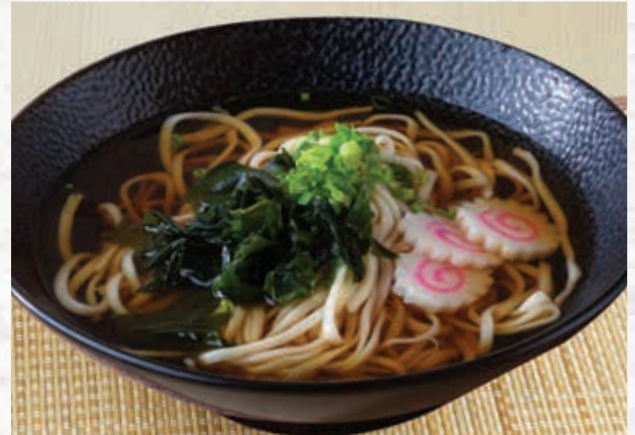
うどん (冷・温) UDON (COLD/HOT) 12.8