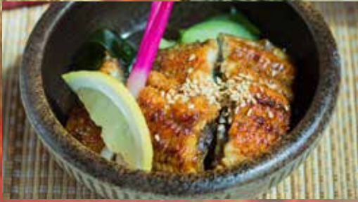
うざく $12.8 UZAKU