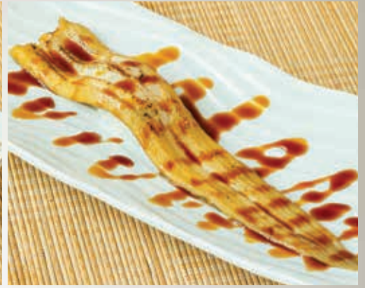
穴子 ANAGO SUSHI