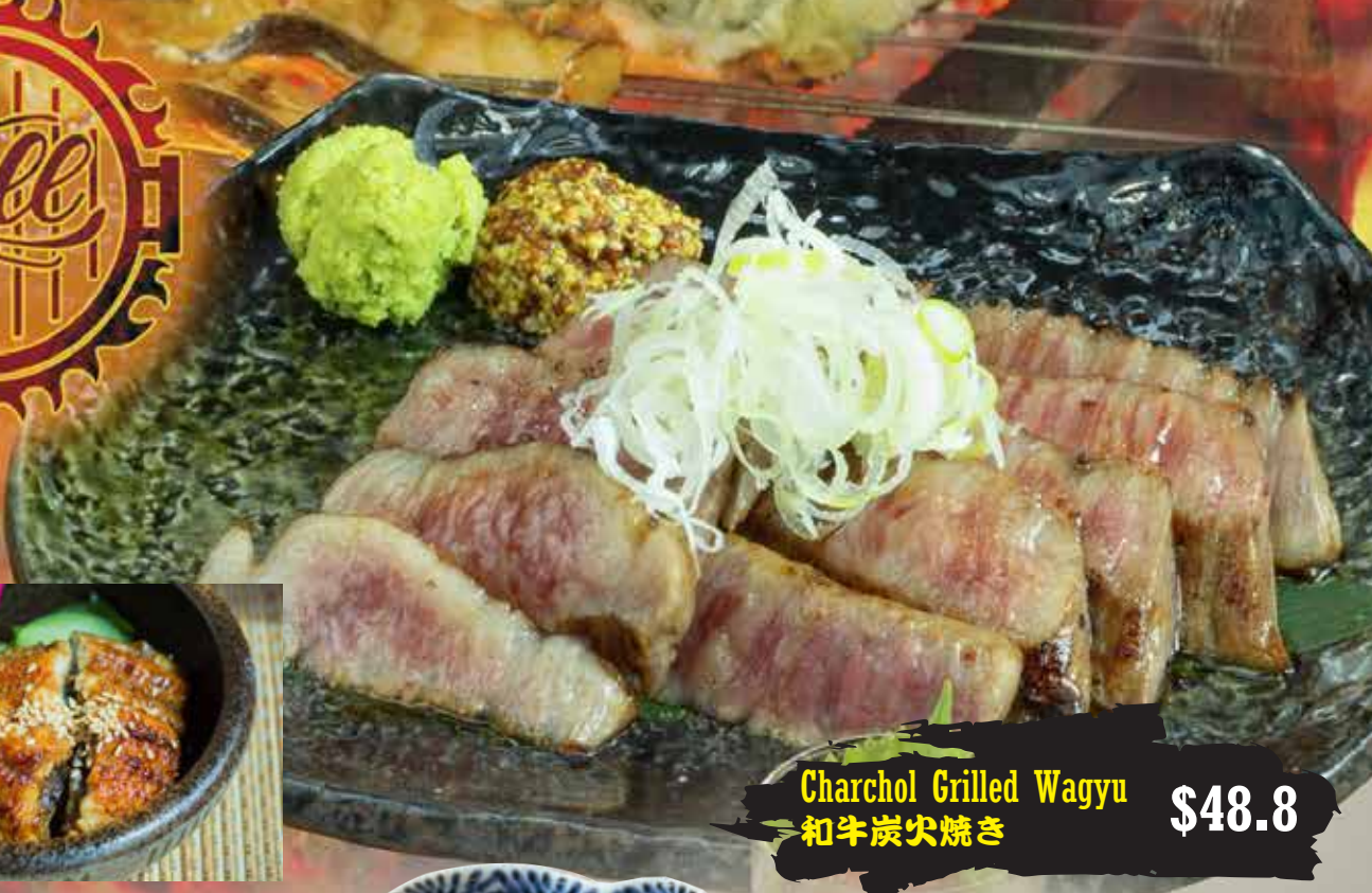
Charchol Grilled Wagyu $48.8 和牛炭火焼き