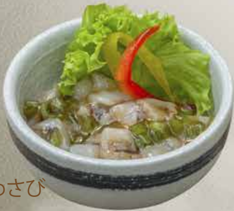
たこわさび TAKOWASABI $4.8