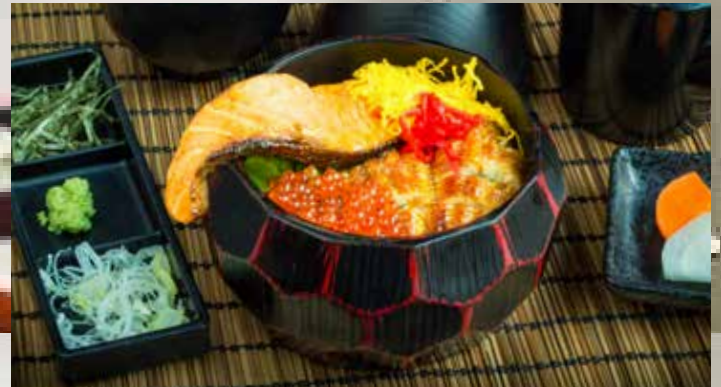
鰻サーモンいくらひつまぶし UNAGI SALMON IKURA HITSUMABUSHI $34.8