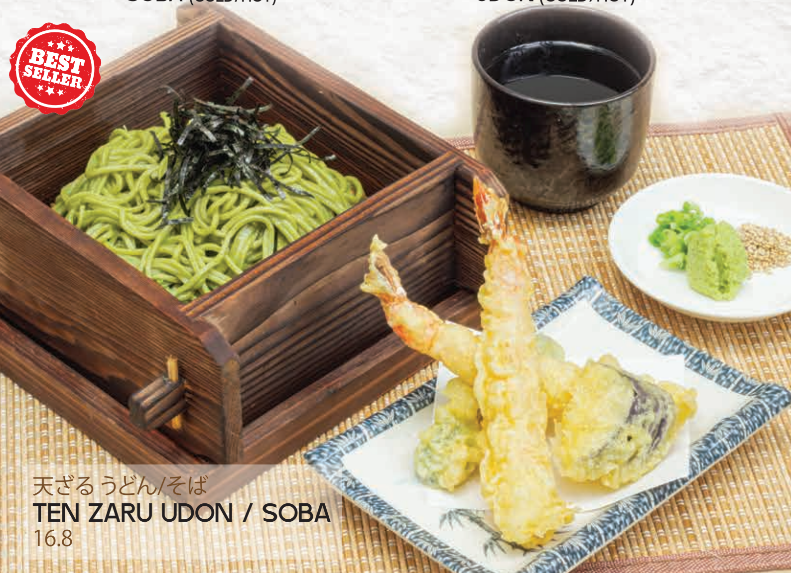
天ざるうどん/そば TEN ZARU UDON / SOBA 16.8