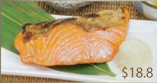
焼きサーモン / 明太子セット $18.8 GRILLED SALMON / MENTAIKO