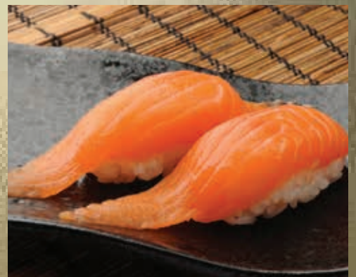
サーモン SALMON SUSHI