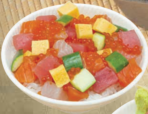
BARACHIRASHI SET 22.8